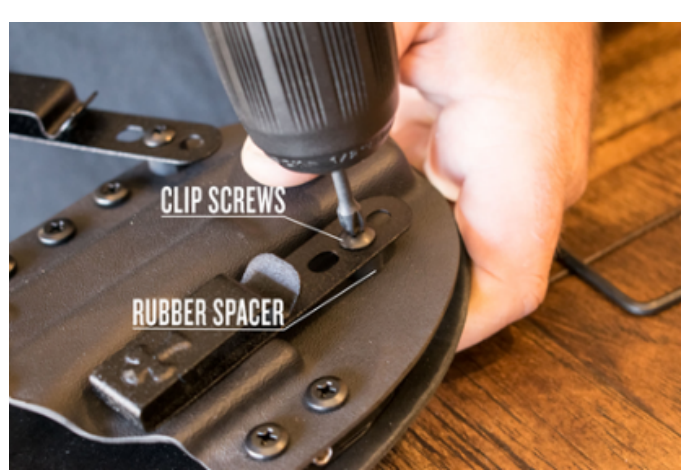
and the desired amount of retention has been achieved.

Locate the screws attaching the clips to the holster. Using a standard phillips-head screwdriver or drill remove the screws from the clips being careful not to lose the binding post on the back of the holster.